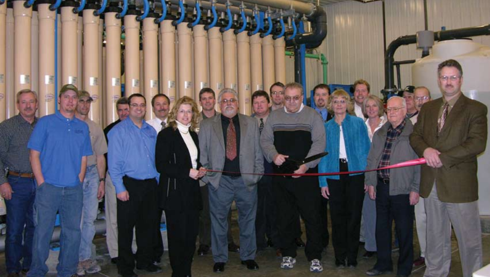
Staff of the Rapid Valley (S.D.) Sanitary District gather for the ribbon cutting on its new water treatment plant.

body through which local governments share resources.