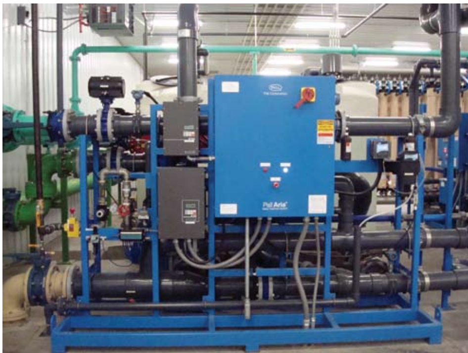
Rapid Valley’s new treatment equipment.